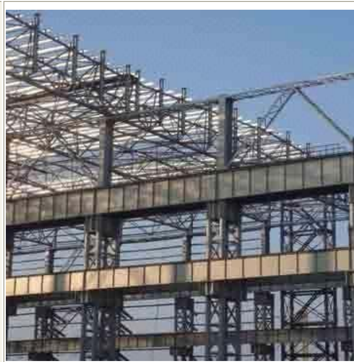
Steel Structure WorkShop 2