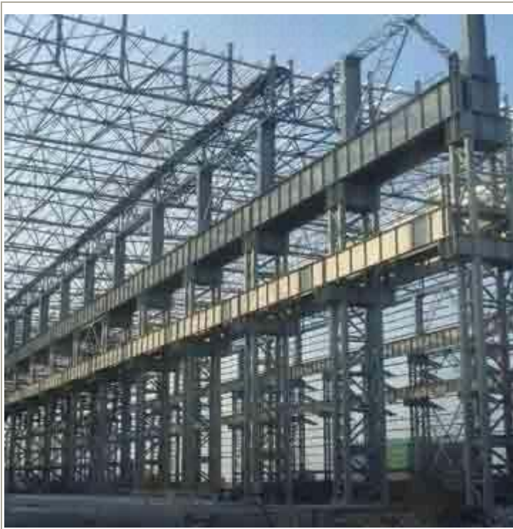
Steel Structure WorkShop 1